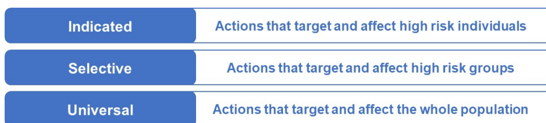
Figure 3: Levels of prevention activity