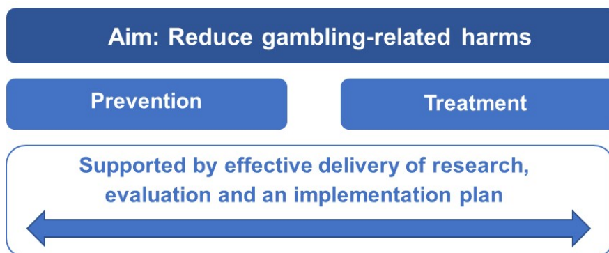
Figure 1: A new approach