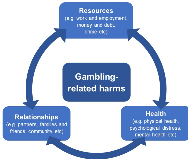
Figure 2: Gambling-related harms